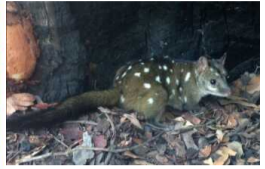
Chuditch (western quoll)