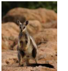
Black-footed rock wallaby