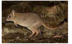
Woylie (brush-tailed bettong)